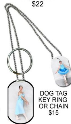
DOG TAG KEY RING OR CHAIN $15