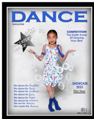
8x10 MAGAZINE COVER $14.00