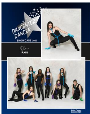
8x10 Custom Memory Mate $16 A collage with team name and colors