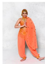
WALLET MAGNET $4.50