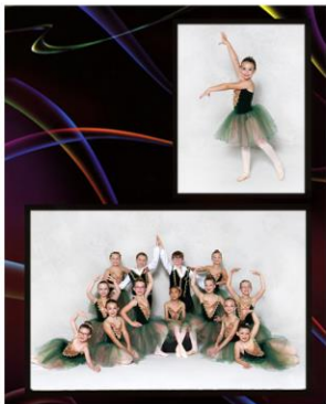
8x10 Memory Mate Folder (Photos included)