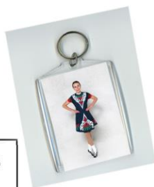
PLASTIC KEYCHAIN $6.50