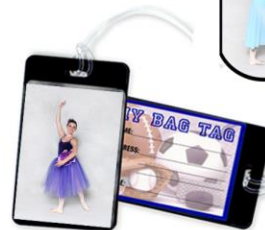
BAG TAG $6.50