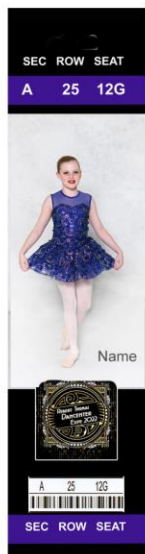
5 - 2"x8" TICKETS - $12 GREAT BOOKMARKS!

E. $26 Emailed Digital File One Individual pose with copyright release Extra poses - $10 each