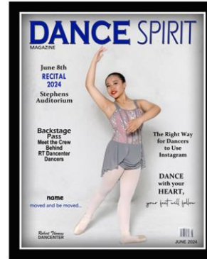
8x10 MAGAZINE COVER $14.00