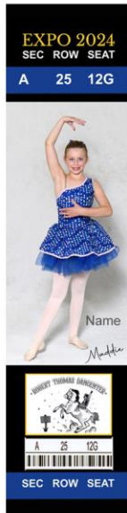
5 - 2"x8" TICKETS - $12 GREAT BOOKMARKS!

E. $26 Emailed Digital File One Individual pose with copyright release Extra poses - $10 each