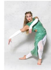
WALLET MAGNET $4.50