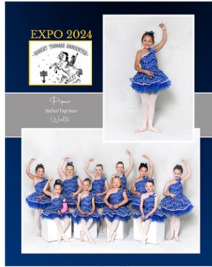
8x10 Custom Memory Mate $16 A collage with team name and colors

A. $58 Memory Mate, 1 - 8x10, 2 - 5x7s, 8 wallets * Emailed Digital File * Individual pose only