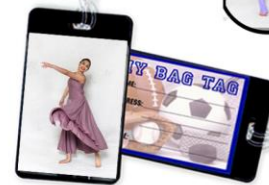
BAG TAG $6.50