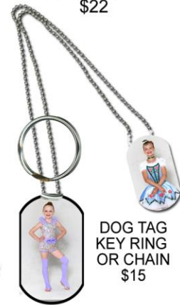
DOG TAG KEY RING OR CHAIN $15

Please print out, and complete the form below and bring to picture day in an envelope with your payment. You should fill out one form per routine. You only need to fill out the address and phone number on one form. Just one check, or information from one credit card (on one form) is needed for ALL orders. Order forms will be available at the studio on photo days as well. If you have questions, please call Pete Tekippe Photography at 1-515-509-1361 .