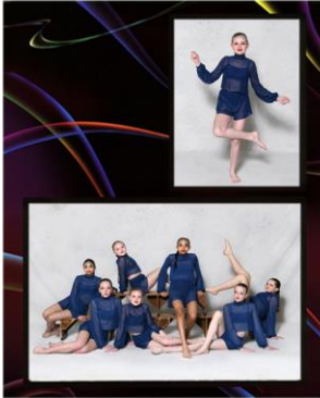
8x10 Memory Mate Folder $16 (Photos included)