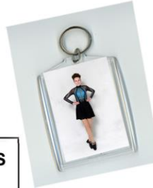
PLASTIC KEYCHAIN $6.50