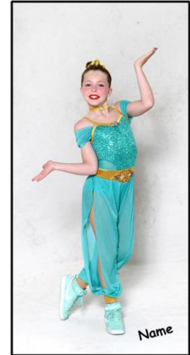
10x20 INDIVIDUAL POSTER - $22